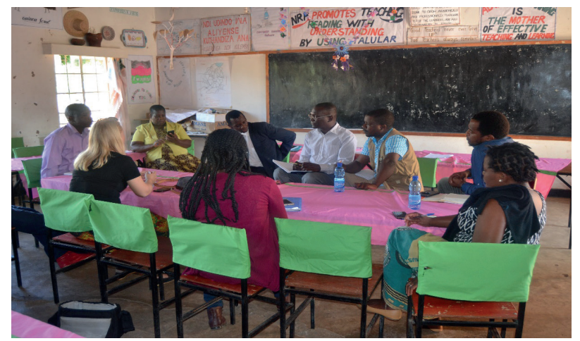
Concern Officers interacting with government officials during a quarterly programme review field visit in Nambiro TDC, Phalombe Boma, July 2018.