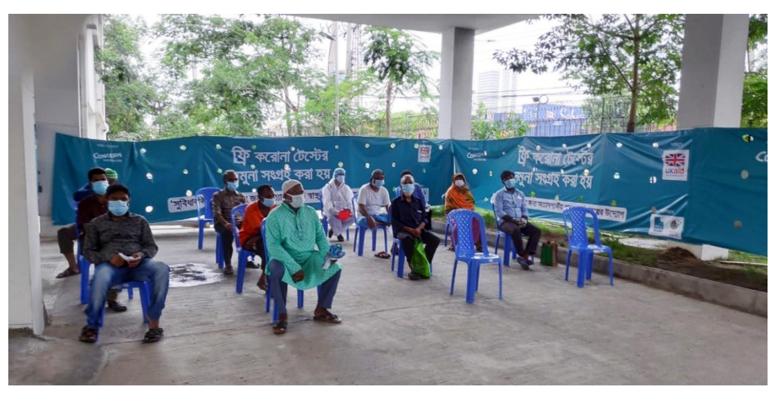
Waiting area at Digital Booth - Concern Bangladesh in collaboration with local partners, have launched New Digital Booths in Dhaka, for screening and testing of Covid-19. Following a digital consultation with a doctor, patients showing symptoms are guided to a booth where samples are taken to test for Covid-19. Patients receive results within 48 hours, additional advice and preventative supplies such as masks, if required.

Across the four countries, slight differences were observed in terms of people's willingness to attend at health facilities, although this has changed in each context over time. This was predominantly driven by a fear of contracting Covid-19 at a health facility, even though cost also features prominently in terms of people's decision-making on whether to seek heath care.