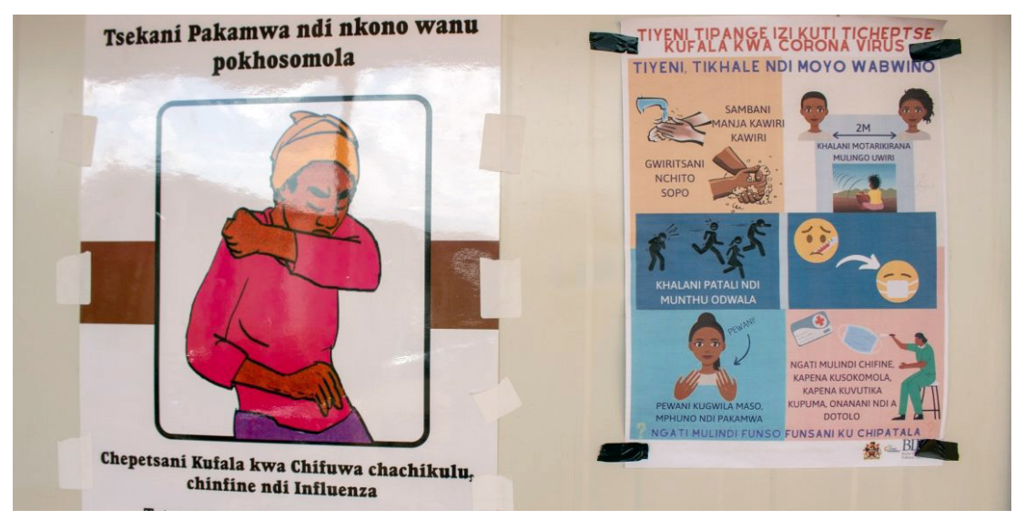
Covid-19 messages are displayed in words and in images to ensure easy understanding. Lilongwe, Malawi.

themselves. " Another common misunderstanding, particularly prevalent amongst men, was you should " visit the hospital when you are sick " (in Sierra Leone) rather than quarantine. While the rumours and stories people hear also cause some confusion, in Malawi, respondents spoke about how a child had suffocated wearing a mask in a nearby village.