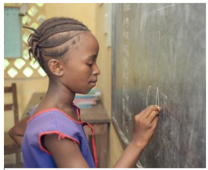
Class 1 student at Benevolent Islamic Primary School in Makinth Sierra Leone 2015