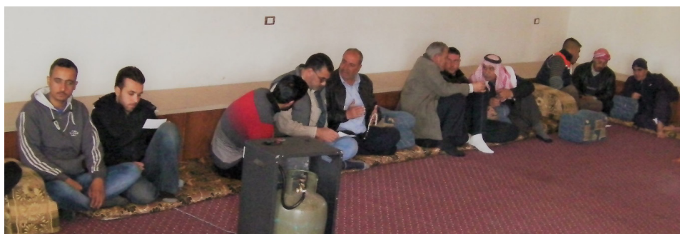
Men’s session, North Lebanon (names of participants and photographer redacted to protect identities).

Concern Lebanon’s psychosocial support programming and, in particular, its Engaging Men approach were evaluated in 2016 by University College Cork (UCC) and the American University in Beirut (AUB), and in 2020 by the Balamand University. The UCC evaluation found that within their families, results indicated many men expressed greater empathy towards their wives and their needs, and increased dialogue and positive time spent with children. The Balamand University evaluation reported that the intervention was effective amongst men, women and children given the reported changes in behaviour and attitude following the sessions.