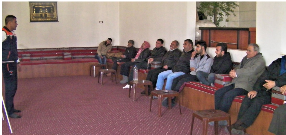
Men’s session, North Lebanon (names of participants and photographer redacted to protect identities).

women and men. Our ultimate aim is to move from ‘gender-sensitive’ to ‘gender-transformative’ programming. Gender transformative programming seeks to challenge and transform rigid gender norms and relations that can be harmful within communities.