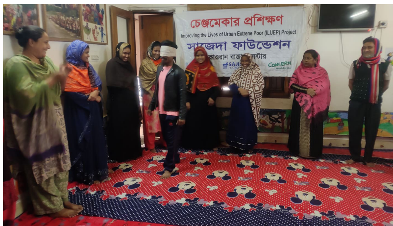
Change Maker training session with Sajida Foundation in Karwan Bazar, Dhaka, 2019.