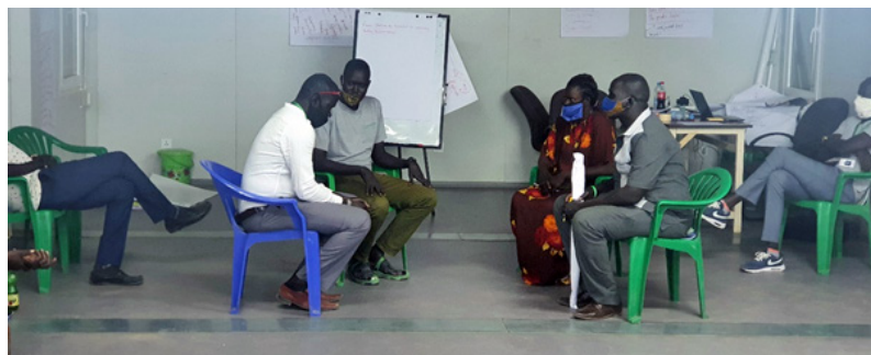
Participants performing a role play during the activity: 'Intimate Violence', 2021.

There has been an increase in demand from different Concern country programmes, and demand for continued engagement from countries that have previously received Sonke's visits. For example, the Bangladesh country office has requested Sonke to come for the third time in 2022 and assist them with conducting a mini-evaluation/review of the Engaging Men and Boys and Change Maker approach in the 'Improving the Lives of the Urban Extreme Poor (ILUEP)' programme. It is exciting to see this sustained interest and we look forward to continuing to work with Concern in engaging men and women in gender transformation.