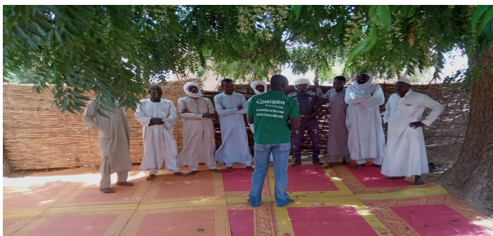
Session for men engaged in gender transformative, Doroti village, Photo : Concern Worldwide, May 2022

The promotion of gender equality remains one of Concern Worldwide Chad's main priorities . Promoting male engagement and supporting behavioural change in favour of positive masculinity are important elements for advocacy .