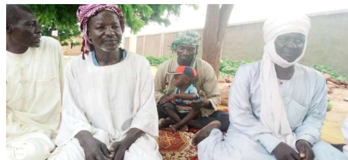
Men attending session with a father looking after his child, Kadjaske village, 11 Oct 2022