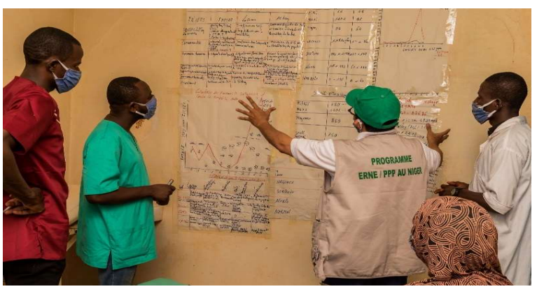
Photo 1: Concern team on a support supervision visit to a health facility in Tahoua region, 2021

This is evidenced by the national ownership of the approach , through the development and adoption in July 2021 of a national strategy for 'The Surge Approach applied to Nutrition '.