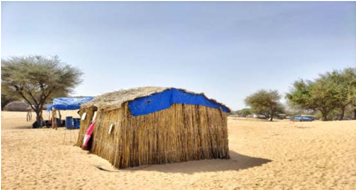
General set-up, Mobile clinic in Ngourtoutkou Mboua, Photo by Concern Worldwide, Dec 2021