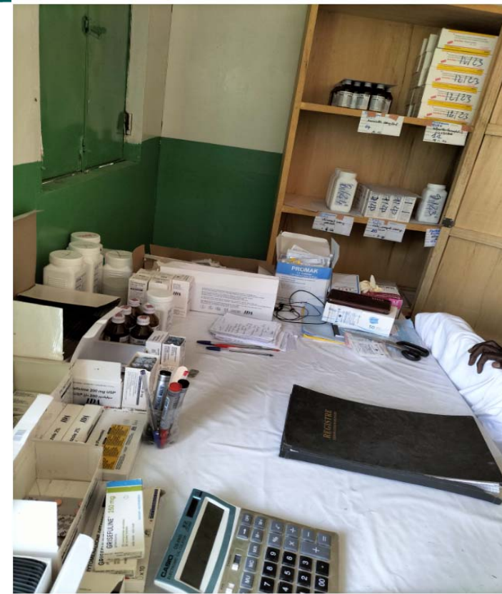
Dispensing pharmacy, Fourkoulom Health Post, Dec 2021