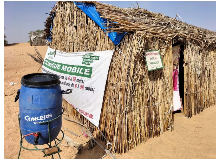
Dispensing pharmacy, Mobile clinic in Ngourtoutkou Mboua, Photo by Concern Worldwide, Dec 2021