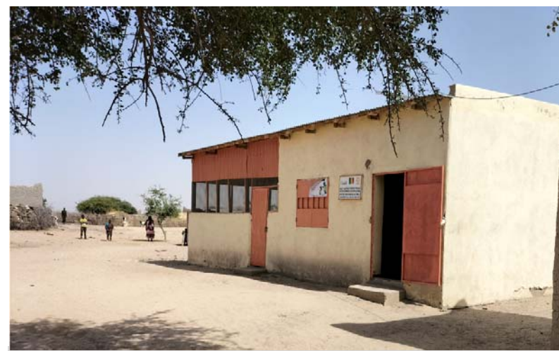
Kalia Health Centre, Dec 2021