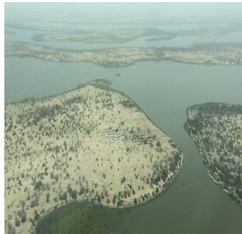
Aerial view of the Lake region, Photo by Concern Worldwide, Sep 2020