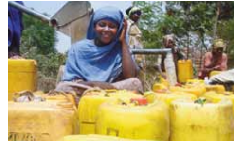
Shallow wells provided by Concern, through an implementing partner, Bani'adam, in Lower Shabelle.

Our approach is grounded in partnership with the communities in which we work. Men and women from these communities provide labour, skills, time, land and other inputs for our projects. These lasting partnerships have resulted in unique trust, confidence and respect with communities and from other humanitarian organisations.