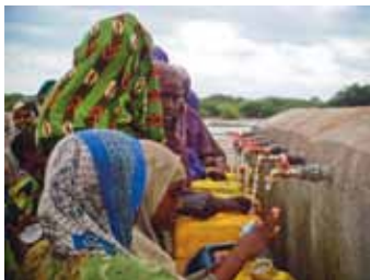
A community water source built by Concern, Bay Region. Concern Worldwide, 2007