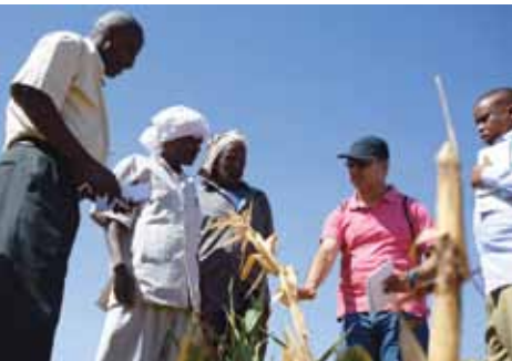
A community field assessment meeting between Concern staff and farmers in Gabiley, Somaliland. Phil Moore, 2010

We are expanding our FIM programme to reach 55,500 people in Gabiley region, Somaliland. The programme will include: FFSs, SHGs and watershed management, and will be integrated with health interventions