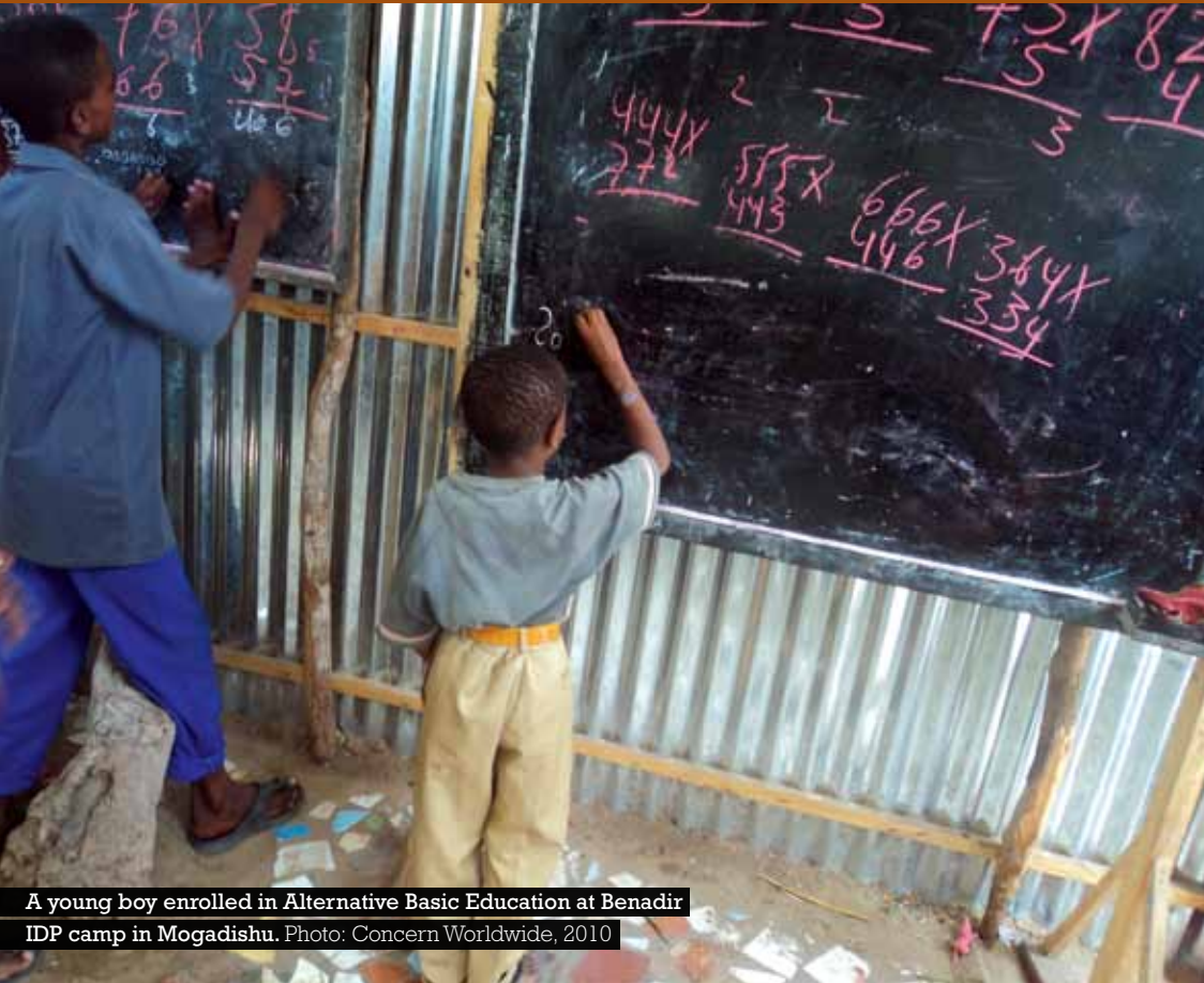
A young boy enrolled in Alternative Basic Education at Benadir IDP camp in Mogadishu.

More than one in ten children around the world never get the chance to go to school. Access to education is not only a basic human right, but also a key factor in reducing poverty and child labour.