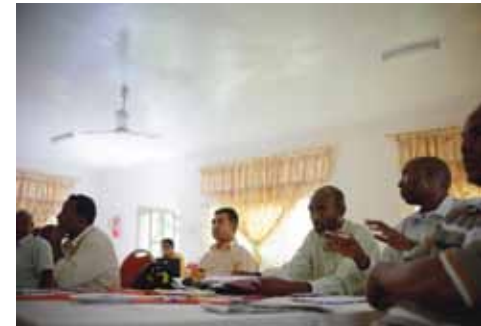
Concern staff participate in an ICRISAT organised workshop in Somaliland.

Bringing together people, organisations and institutions to pool knowledge, skills and resources, we link communities with national and international research and development institutions, providing them with technical support and knowledge.