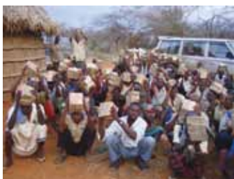
Men excavated water catchments in Sharifay village, Bay Region, in 2009 as part of a cash for work project.