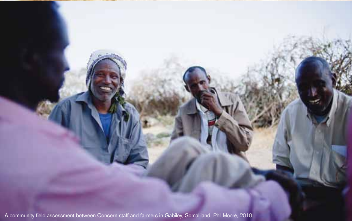
A community field assessment between Concern staff and farmers in Gabiley, Somaliland.