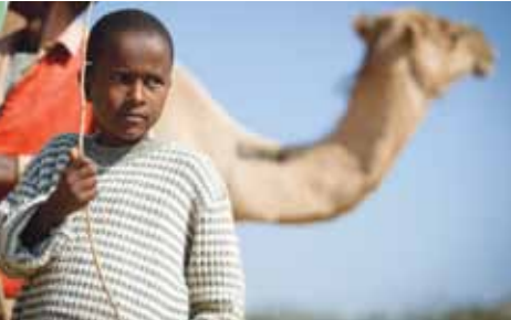
Camel market, Somaliland.

Somalia is one of the poorest countries in the world, devastated by over twenty years of conflict. Since the collapse of the central government in 1991, the country's infrastructure has been in decline and services are largely provided by the private sector or aid industry. Almost half the population is under the age of 18, and have never known their country without war.