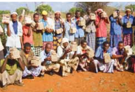
Men receive payment for a cash-for-work programme. Concern Worldwide, 2009

In many areas of Somalia, drought, flooding and conflict still overwhelm poor people's precarious livelihoods, leading to displacement and loss of income. When this happens, Concern's Food, Income & Markets work responds through a range of social protection and safety nets to ensure the poor can access food and services in the local market.