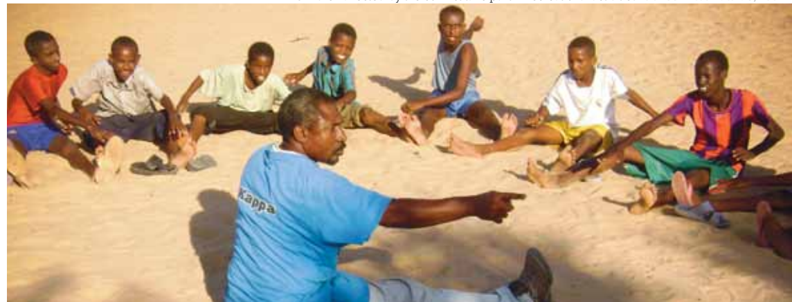
Children affected by the conflict take part in recreational activities.