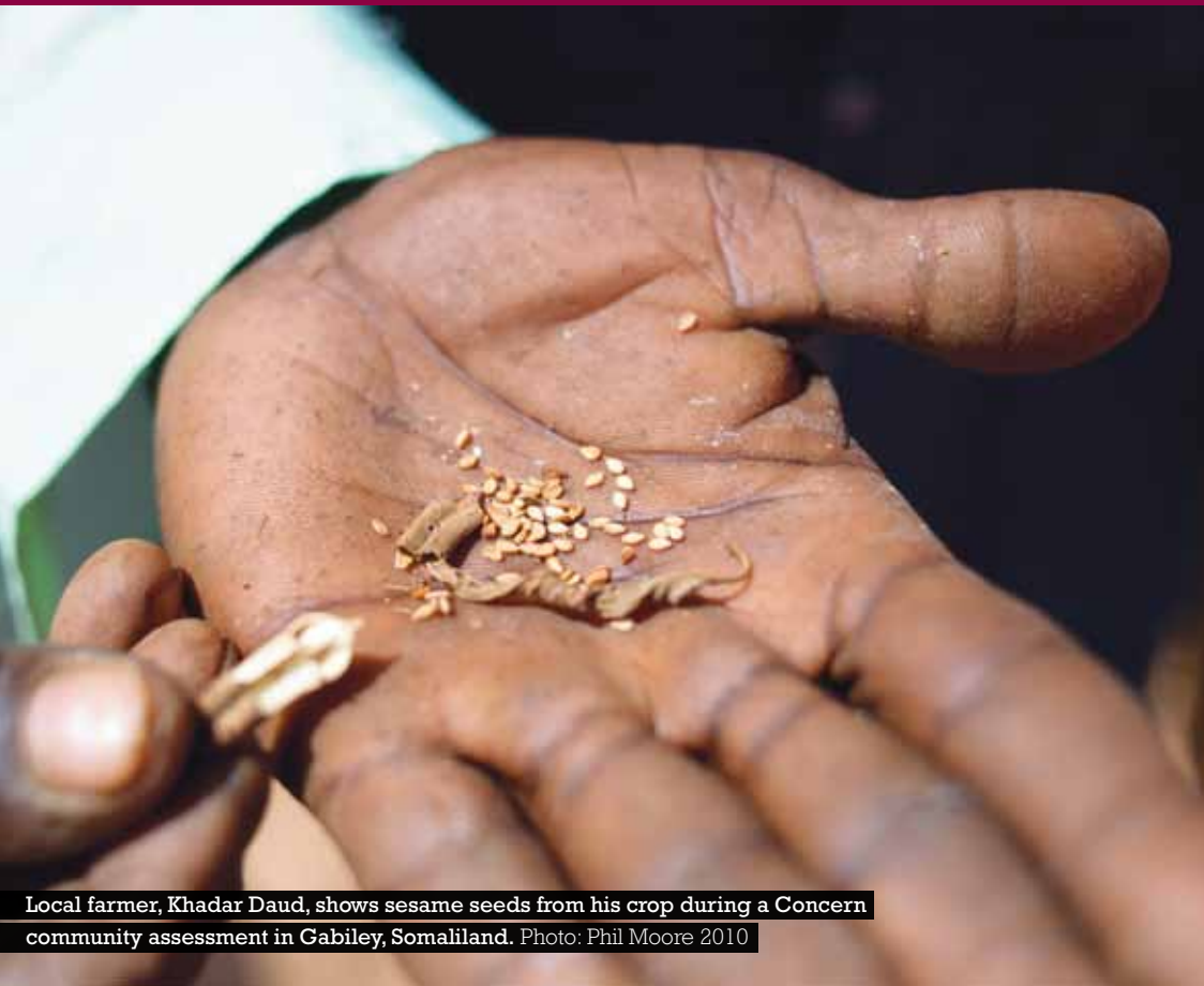
Local farmer, Khadar Daud, shows sesame seeds from his crop during a Concern community assessment in Gabiley, Somaliland.

Today, almost one billion people around the world are forced to survive on less than one dollar a day.