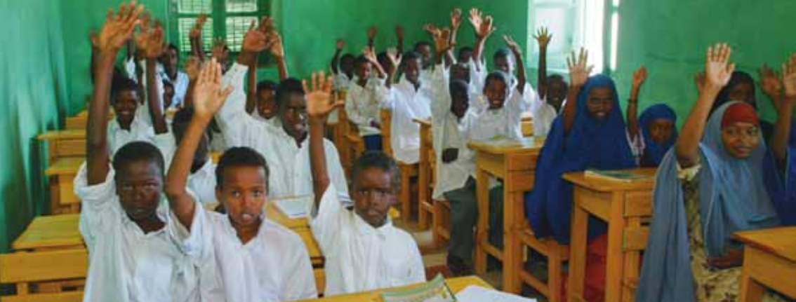
Children at a Concern supported school Liam Burke, 2003