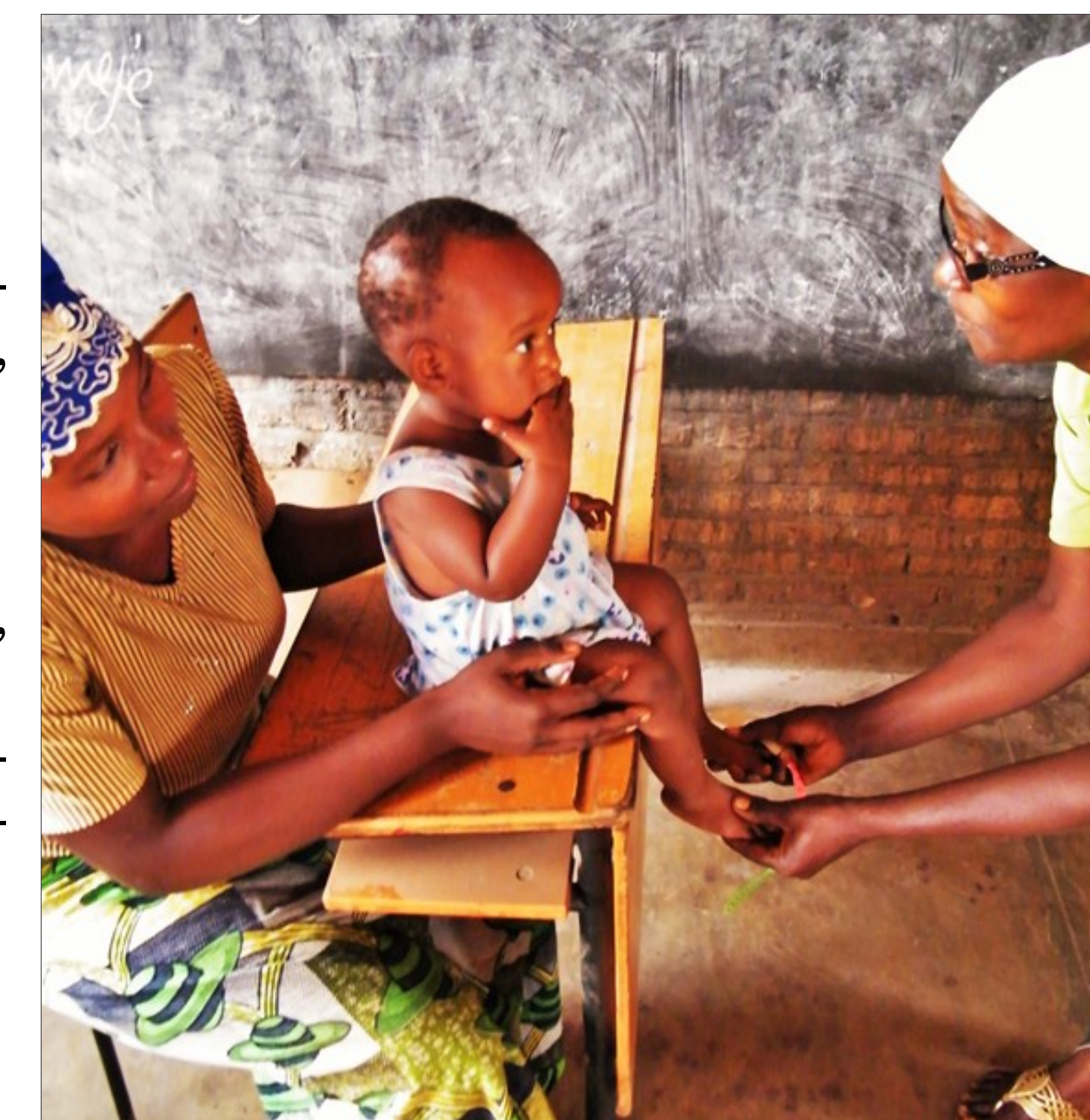
Picture 2 : A CHW shows how to identify oedemas during a training session in Nyamitanga, Cibitoke © Irénée Nduwayezu.