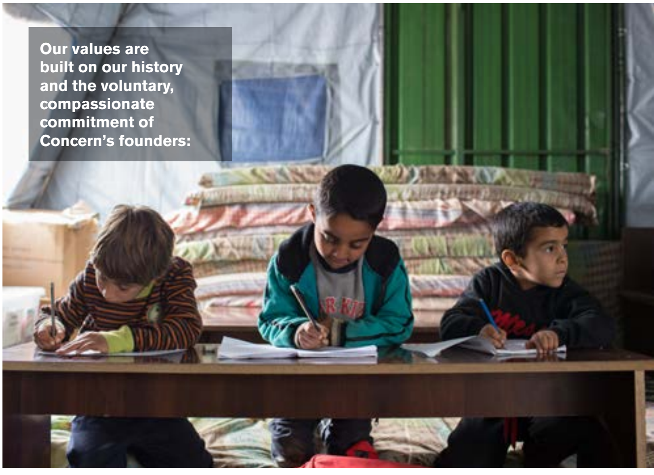
Syrian refugee children write on their notebooks during a non-formal education programme at an informal tented settlement in Lebanon. The children in this class are aged between four and eight.