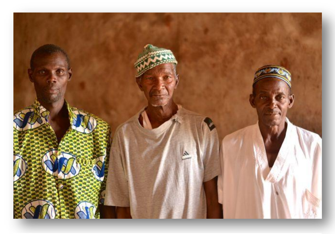
Image 9 Male elders in Kumrabai Junction reflected that the skills imparted by this project would help households to become developed.

below, an elder male participant explains that his perspective, emphatically supported by the other FGD participants, that money and assets undermine sustainability.