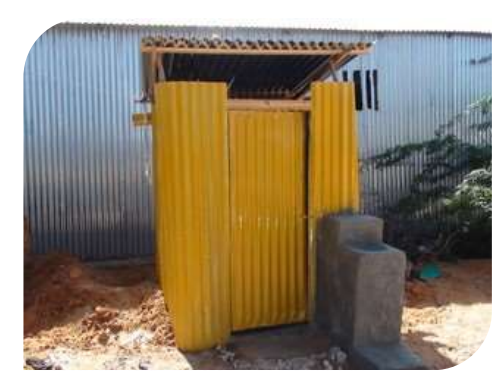
Repaired Latrine

The evaluation observed that the quality of the super structures in Mogadishu were of better quality in terms of finishing compared to those in Gedo region.