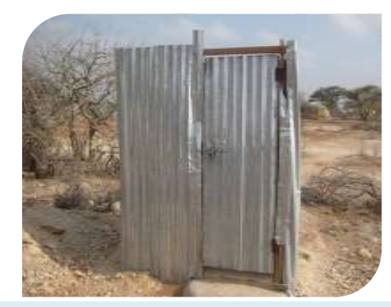
Figure 3: Constructed Latrine in Dharkaynle village, Ceelwaq district

The evaluation further sought to examine the practice of hand washing among community members in Gedo region and the findings revealed that an overall proportion of 85.6% of the respondents used soap across the 12 villages to wash their hands (compared to 1% during the baseline survey), 4.8% used ash (compared to 3.9% in baseline survey) while 3.7% used sand.