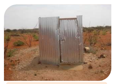
Figure 2: Latrine in (Harer hoosle) village-Belet Hawo district

The practice of proper disposal of children waste remained below expected standard as only 43.7% disposed their children's waste in the latrine. This remains an area of concern that should be addressed by LLG through the hygiene promotion initiatives.