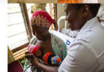
Figure 4 Overcoming socio-cultural barriers to the scale-up of kangaroo mother care and preterm care. Both caregivers and providers may have barriers to the uptake of KMC. Local context must be taken into account to understand and overcome these barriers. Based on literature and programme experience of the authorship team, we summarise some of the common barriers faced and enablers found. KMC: kangaroo mother care.

Risk of losing power or finances: In for-profit systems, KMC might be less favoured in contrast to neonatal intensive care unit admissions, which result in greater income generation for facilities. Conversely, KMC follow-up in private practice has the potential to become a source of income for providers previously resisting it. Other enablers for providers have to do with the ability to disseminate scientific evidence of the impact of KMC, particularly to gain recognition and endorsement by those perceived to be in authority.