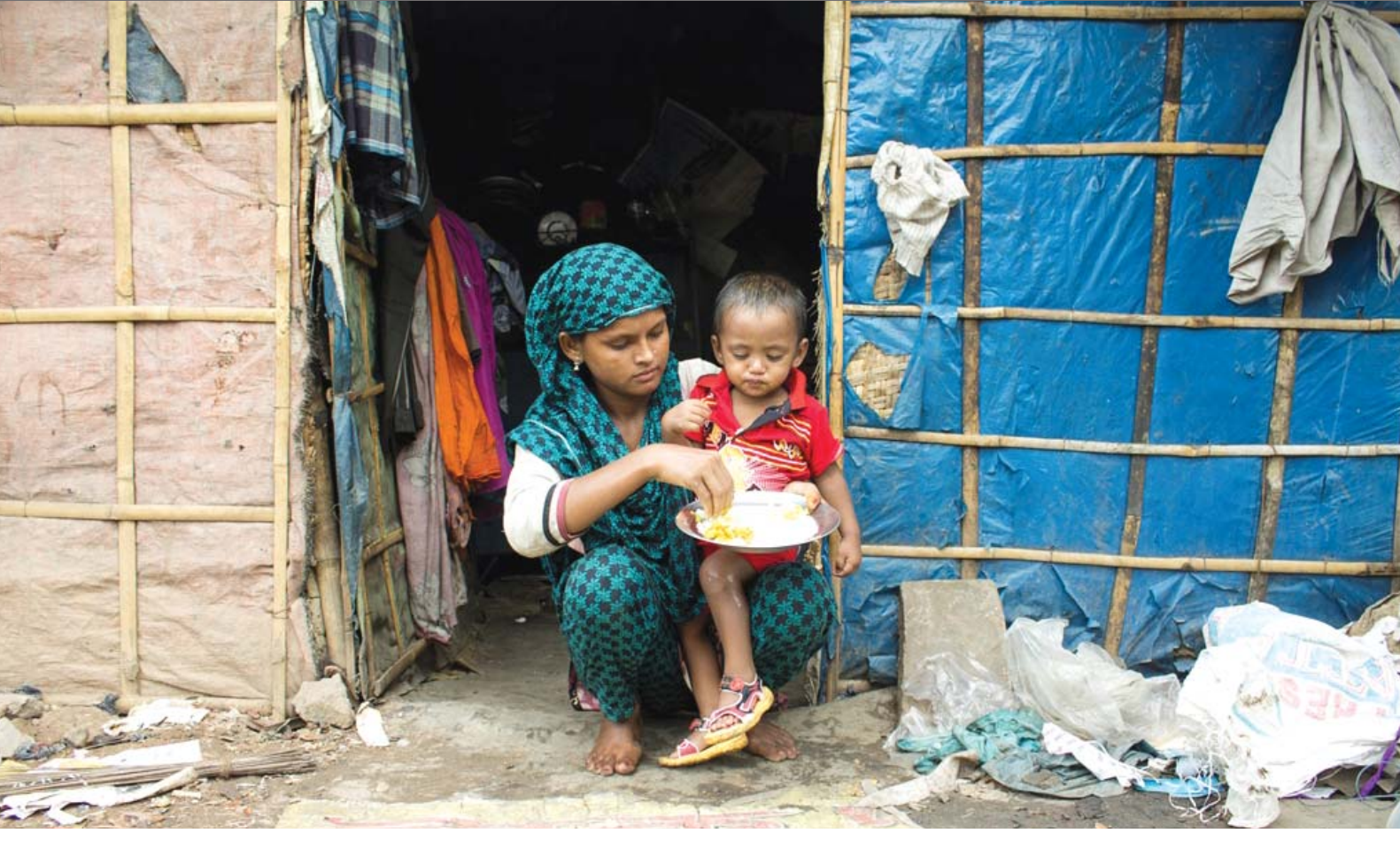
A participant of Concern's Integrated Urban Nutrition Project feeding her child at home in a squatter settlement in Dhaka.

Demographic Health Survey 2014 supports this statement. 'Women in urban poor settlements practice exclusive breastfeeding for only 2.7 months<sup>6</sup> on average. Men and other family members are not sensitized on the importance of exclusive breastfeeding for the first six months and the recommended IYCF practices, and thus do not support women during pregnancy and lactation period. Several informal discussions revealed that knowledge of women around importance of exclusive breastfeeding is very high (around 85%); however, practicing comes with a number of challenges.