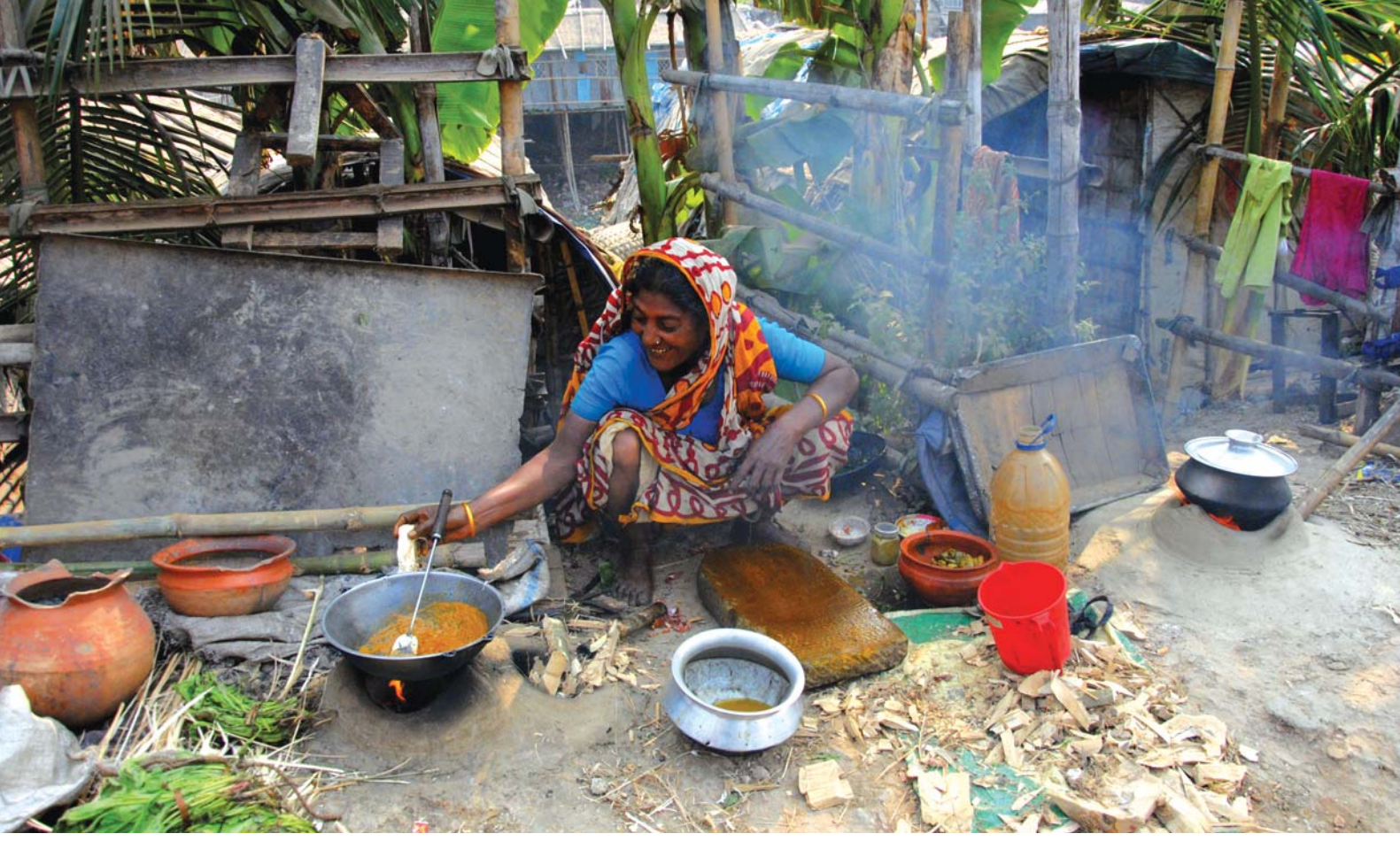
Extreme poor families cope with high costs of living in cities by compromising on living conditions in squatter settlements.

with nutritious food is therefore a challenge for extreme poor people living in urban areas. Parents were not aware about the nutritional value of seasonal fruits. Their perception is that imported costly fruits contain more nutrients. The baseline qualitative survey report supports this statement- 'Most respondents believe that nutrition costs a lot. They perceive that costlier foods (meat, big fish, egg, milk, butter, foreign fruits etc.) offer more nutrition. Since they are aware of their low purchasing power, they seem to accept the idea that their children and they would be under-nourished'.