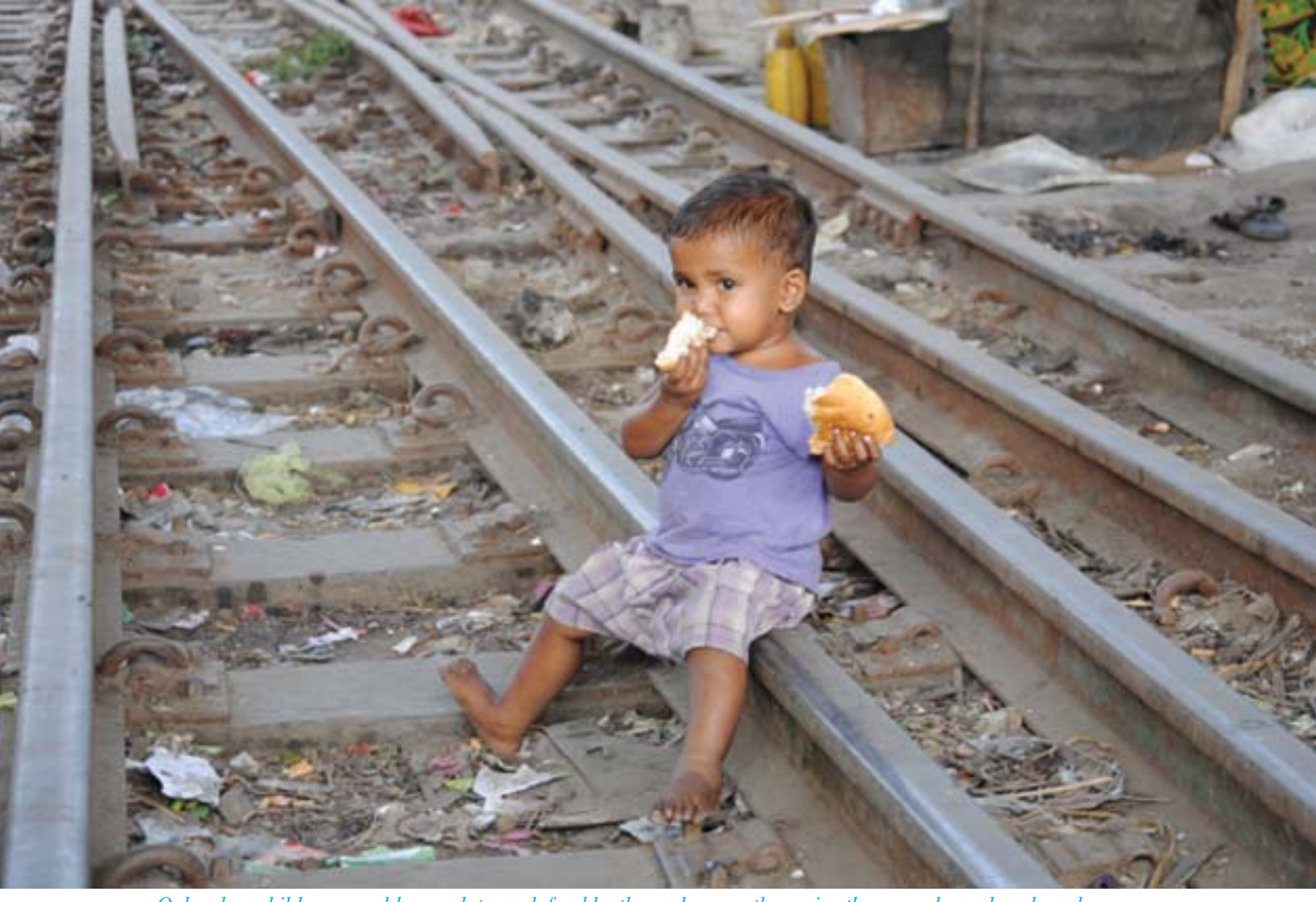
Only when children are old enough to grab food by themselves, mothers give them snacks such as bread, biscuits and cakes. as these are convenient and are easily available in slums and pavements squatter settlements. Concern Worldwide/Dhaka, Bangladesh/November 2011