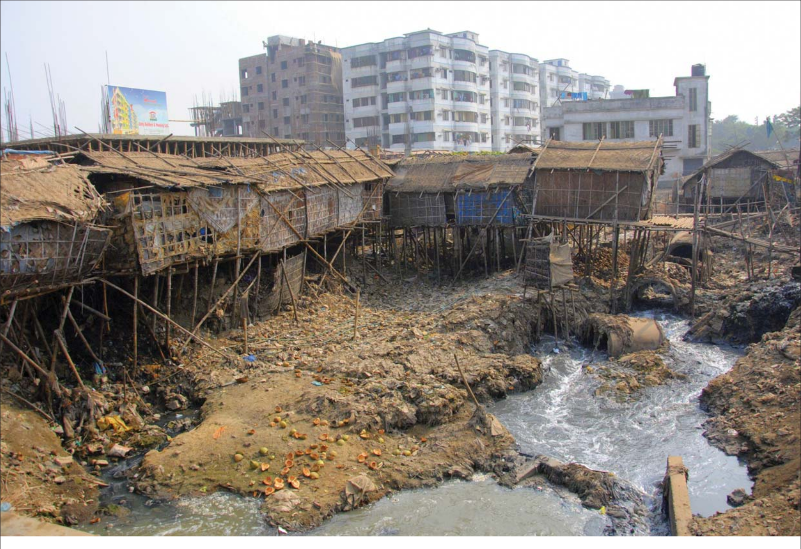
A squatter settlement in Dhaka. Concern Worldwide/Dhaka, Bangladesh/December 2011

long waiting hours, and for the urban poor unsuitable opening hours were found to be the major reasons behind the low utilization rate.