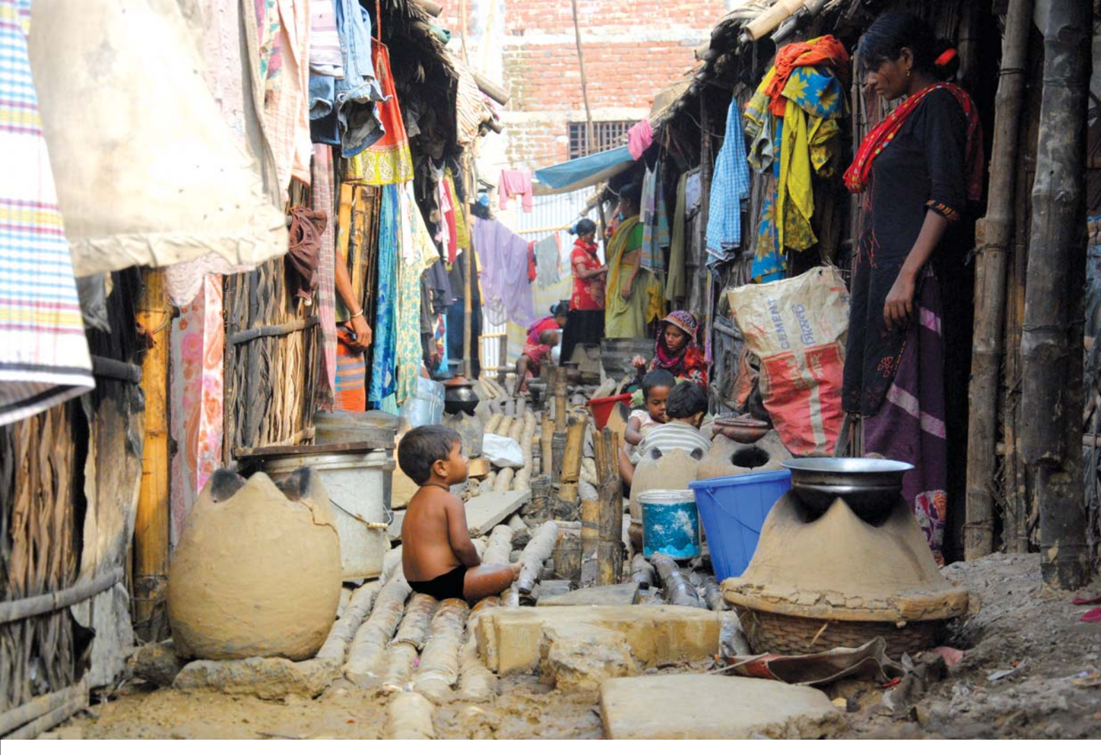
Extreme poor families cope with high costs of living in cities by compromising on living conditions in squatter settlements and on pavements. Concern Worldwide/Dhaka, Bangladesh/ December 2011