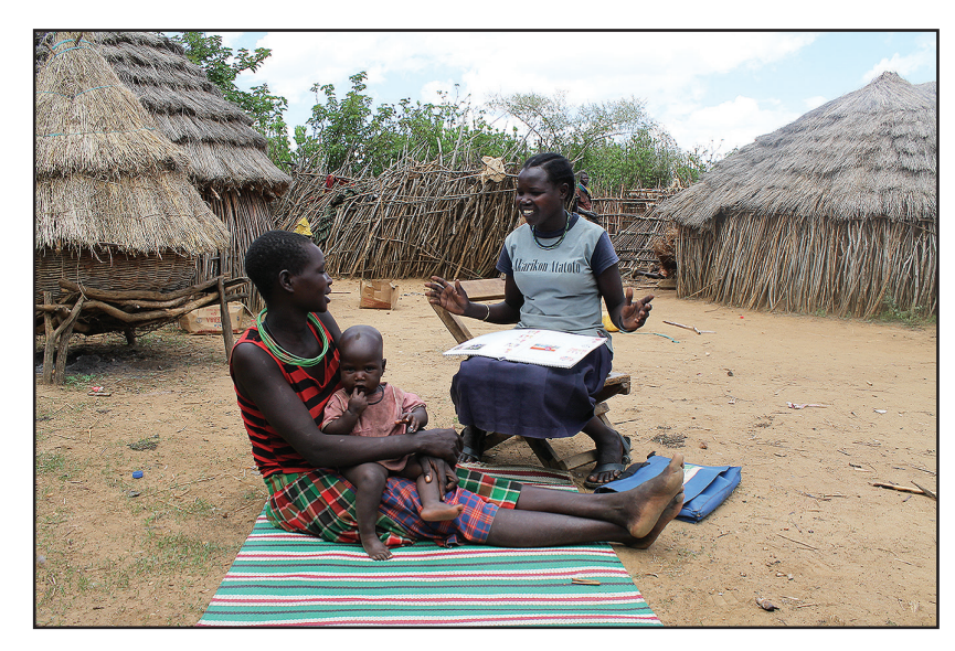
Photo: A Lead Mother counselling a household caregiver during a home visit

As of October 2016, four out of seven modules have been delivered through the cascading system of the MCG approach. These modules consist of the following: an introductory module on the general MCA approach, which incorporated selected behaviors, including vaccinations, vitamin A and antenatal care visits. Module 1 looked at infant and young child feeding practices, module 2 examined maternal health and nutrition, module 3 focused on linking agriculture and nutrition and module 4 examined water, sanitation and hygiene practices. Through the end of the project, the remaining modules will promote behaviors in relation to family planning (module 5), child health (module 6), and health user rights (module 7).