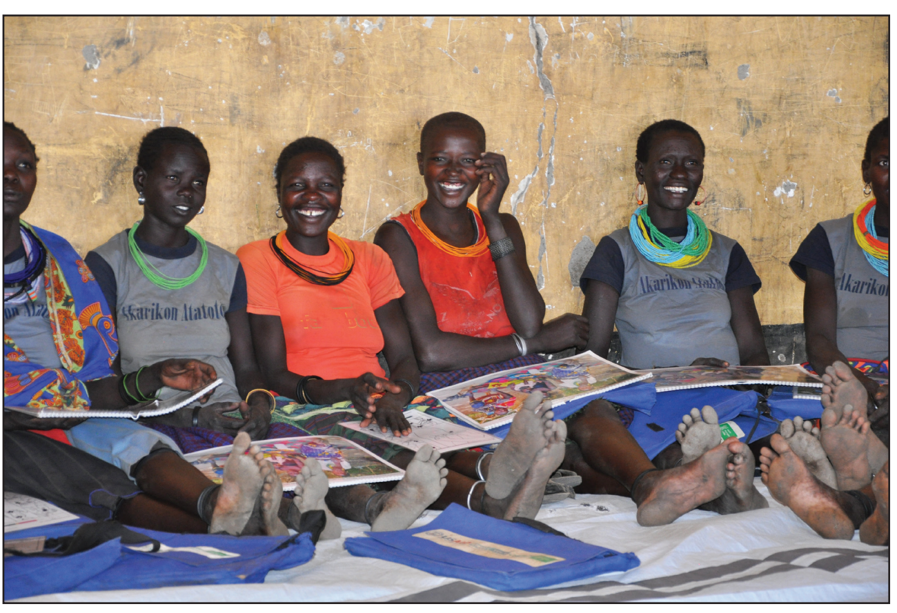
Lead Mothers in Moroto district.