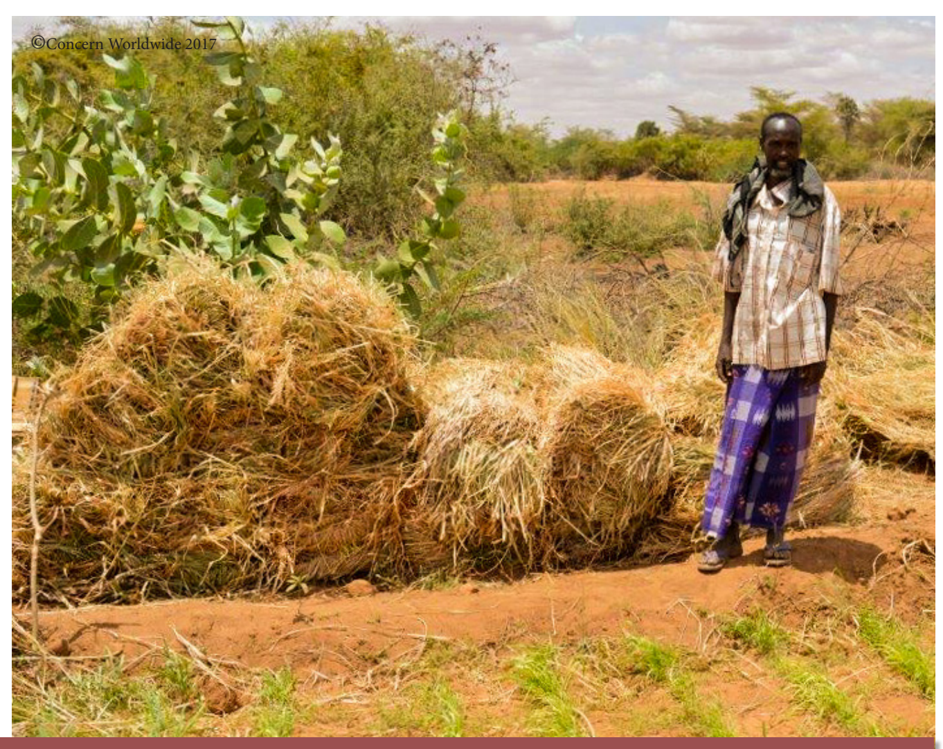
Local farmer that replicated fodder production after seeing it done by BRCiS Fodder Field School Farmers

The scale-up pilot undertook a series of community negotiations as the vast-majority of already-trained Fodder-FS members had already began scale-ups of their own. After detailed community negotiations, signing MoUs, seed purchases, and land preparation, fodder production began in the additional riverine areas during the first week of January 2017. The fodder is to be distributed to vulnerable households with lactating animals in quantities sufficient for 3 lactating goats to be productive through April. One to two harvests will take place depending on the availability of river water as the dry season progresses. The first harvest began in late February and will go to worst-off pastoralist villages and IDPs not from the productive riverine villages, the second harvest will be provided to poor households and IDPs in the riverine communities where the fodder is produced. In all instances, the contracted Fodder-FS and FFS farmers will build relations between communities by working directly beside BRCiS Programme staff to distribute the fodder to their fellow Somalis. The 50-acre scale up will support extreme